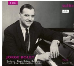
Jorge Bolet: Berlin Radio Recordings, Vol 3

Disc 3 begins with an account from 1971 of the Andante spianato and Grand Polonaise which I did not enjoy at all. It sounds thoroughly bad-tempered, the Andante played as if it were Rachmaninov and the fioritura passages in the Polonaise tight and scrambled. After the three Polonaises (Bolet at his most magisterial) come two specialties: Schumann-Liszt Frühlingsnacht (unmissable) and the J Strauss II-Godowsky Symphonic Metamorphosis on Die Fledermaus ( sui generis ). All in all, a pianophile delight.