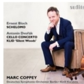
BLOCH Schelomo DVORÁK Klid. Cello Concerto